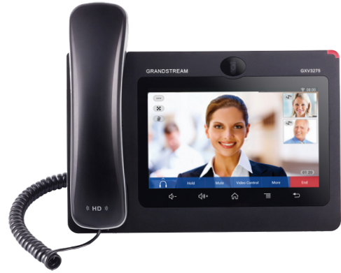
AVM-1 IP Video Attendant Station